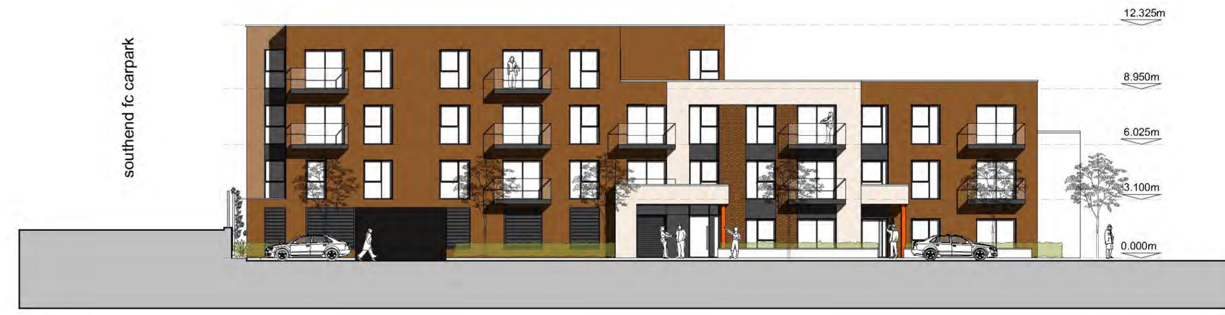
elevation 3 block B - eastern elevation