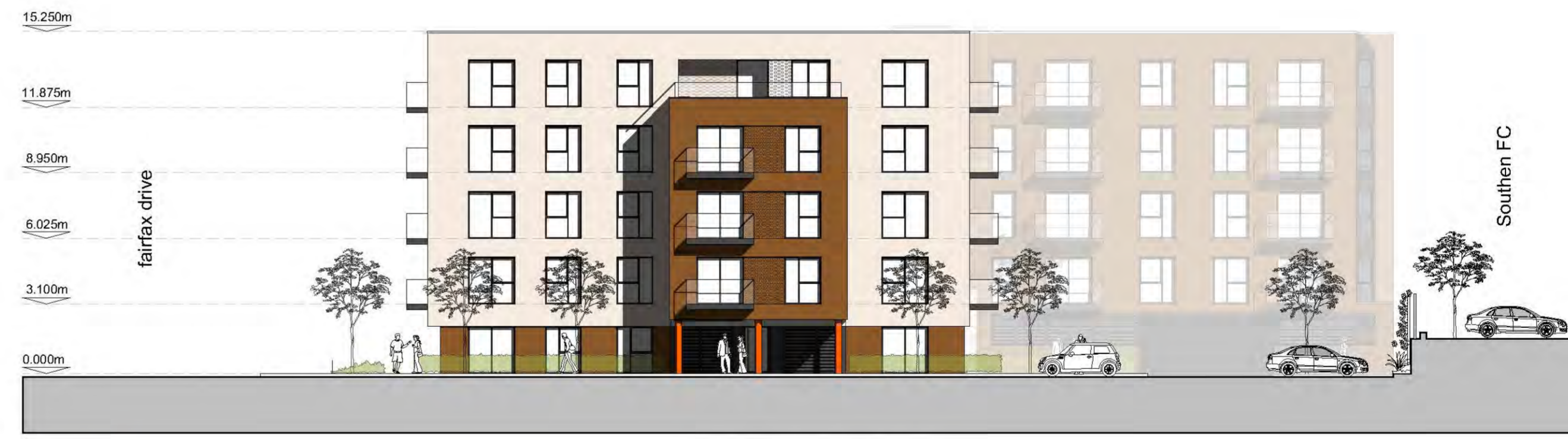
elevation 5 block C - western elevation