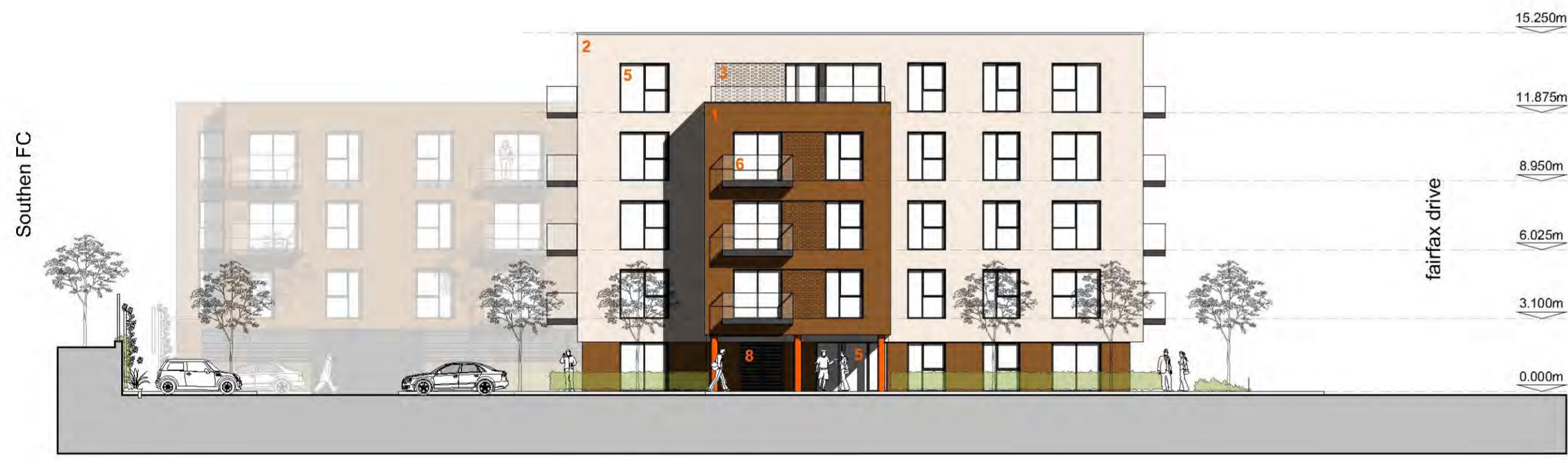
elevation 4 block C - eastern elevation