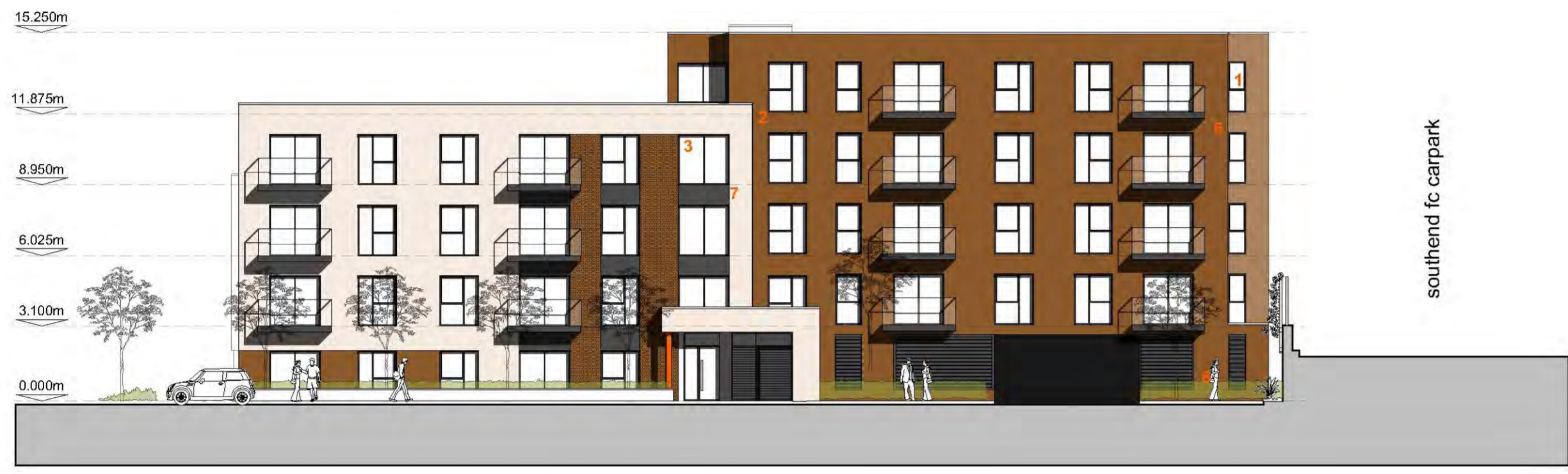
elevation 2 block D - western elevation