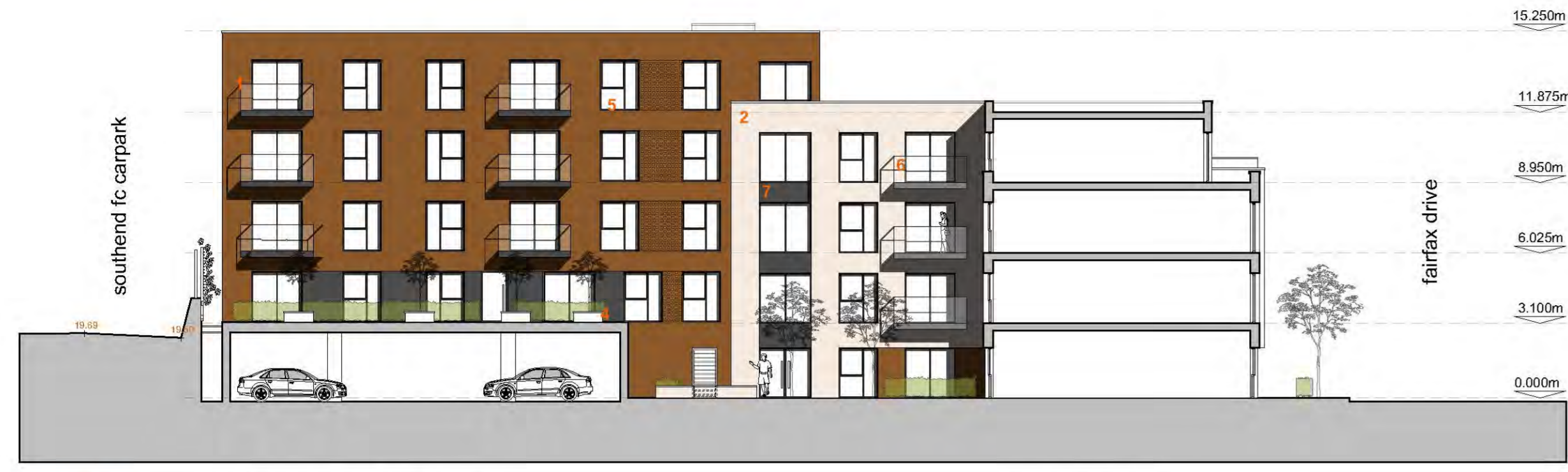
section DD block D - eastern elevation block E - section