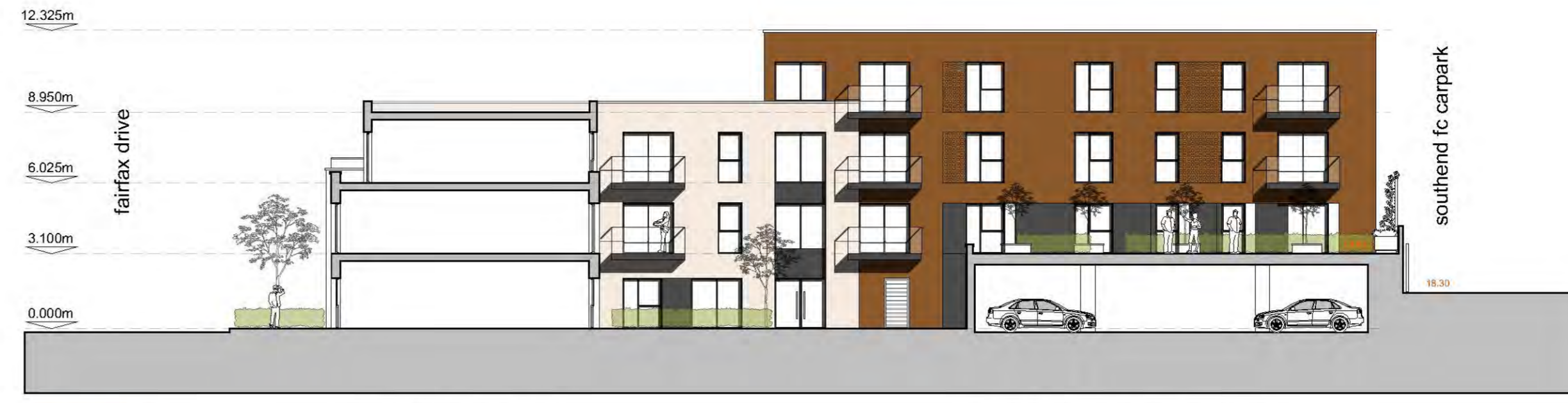
section CC block A - section block B - western elevation